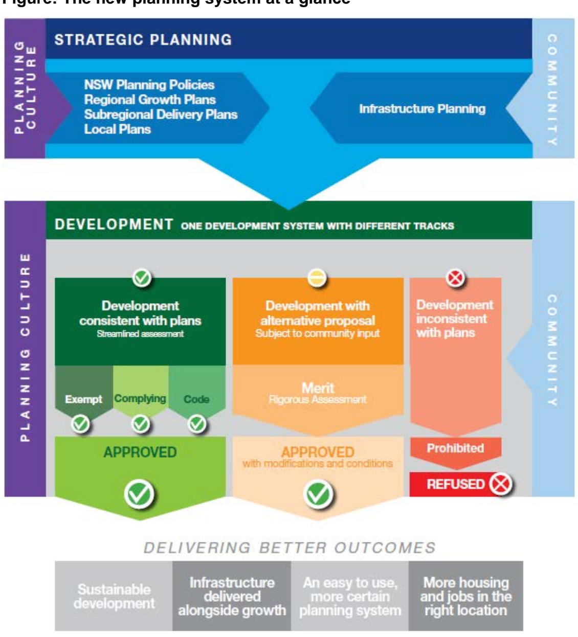
Figure: The new planning system at a glance 169

... to promote economic growth and development in NSW for the benefit of the entire community, while protecting the environment and enhancing people's way of life. To do this, the planning system has to facilitate development that is sustainable. Sustainable development requires the integration of economic, environmental and social considerations in decision making, having regard for present and future needs. 168